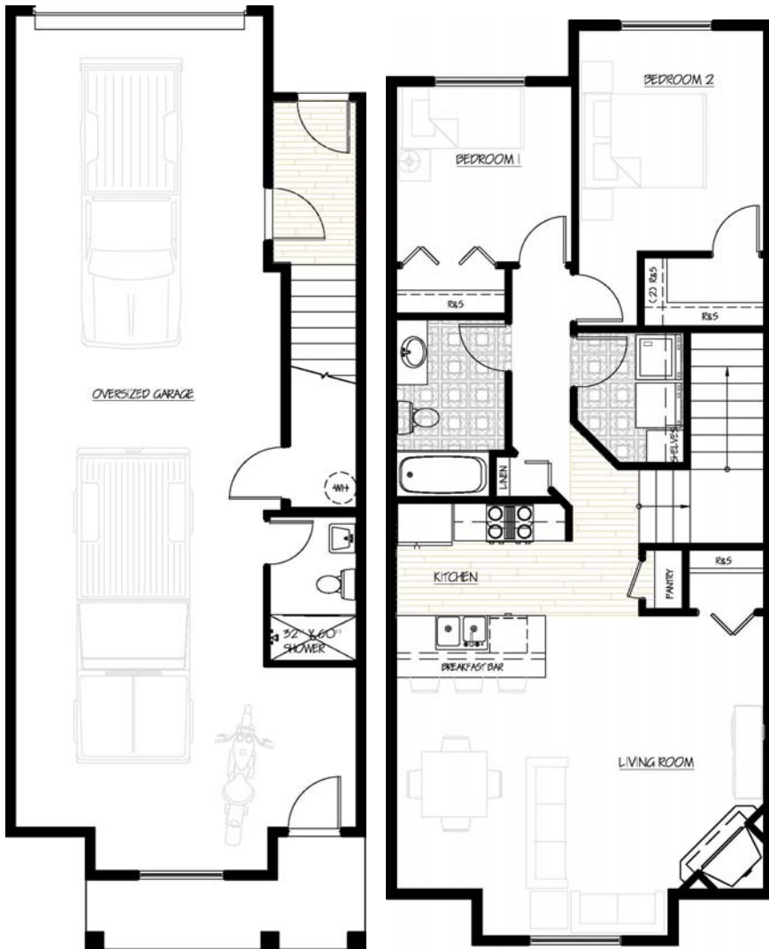
1ST FLOOR (4374)